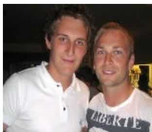
Bowdon 159, Chester Boughton Hall 162-6. Chester Boughton Hall win by 4 wickets Chester leapfrog Oulton to finish 8 th .